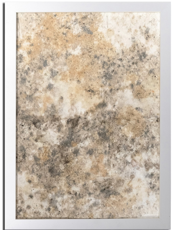
Home + Elsewhere, 2024 + 2025, 32,3 cm x 23,5 cm