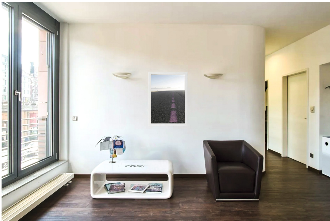
from the series Partikel , 2019, 70 cm x 50 cm