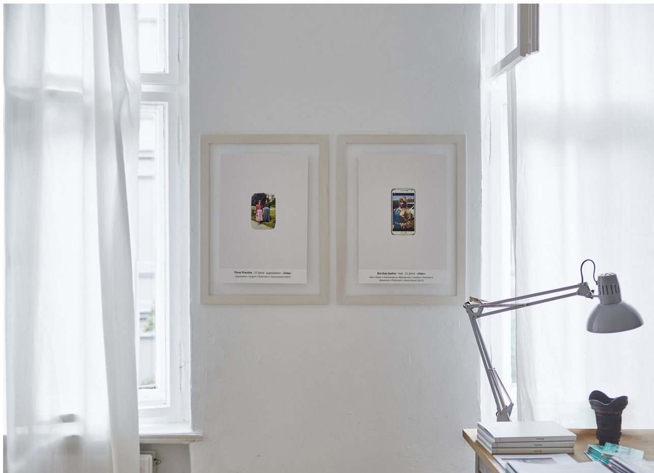
Foto (print) + Foto (digitale file) from the series What remains, 2016 - 2024, 58,3 cm x 44 cm